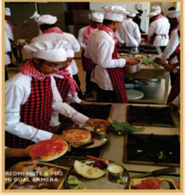
Hotel Management & Catering Technology