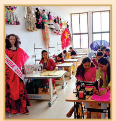
Fashion Designing & Technology