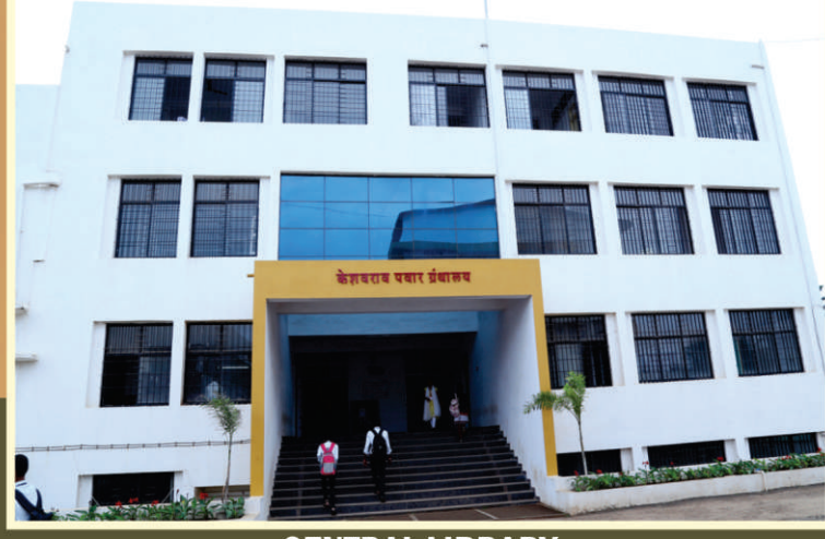
Year - 2023-24